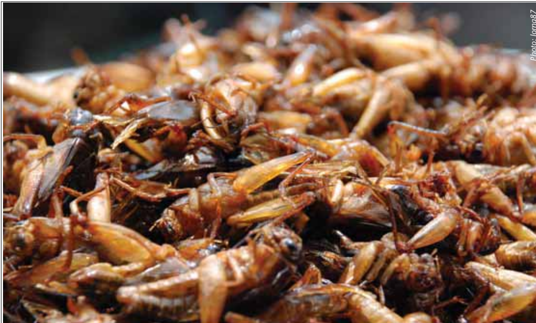
Edible insects provide a good source of protein, vitamins and amino acids for humans and animals. ICIPE is doing research on how to raise such insects in Africa to help farmers cope with the increasing demand for food and feed for their animals.