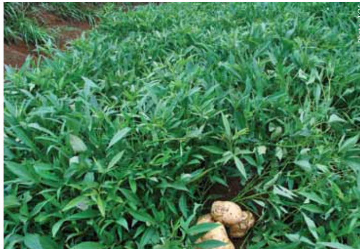
Orange-fleshed sweet potatoes grow quickly and yield upto 20 tonnes per hectare. They are also resistant to major pests and diseases.

Kenya Agricultural and Livestock Research Organisation or KALRO [formerly KARI] uses a three-tier system of orange-fleshed sweet potato seed production system; the primary, secondary and tertiary seed production levels. Primary seed multiplication site is located on-station where closer management of the seed is done. Material from the primary seed multiplication site is used to establish secondary seed multiplication sites managed by Non-Governmental Organizations, Community Based Organizations and Ministry of Agriculture staff. Usually, a selected place such as Agricultural Training Centres are used as secondary multiplication sites. Material from secondary multiplication sites are used to setup tertiary seed multiplication sites. These are the commercial seed multiplication sites managed by individual farmers with assistance from extension staff. When you engage in orange-fleshed sweet potato seed multiplication, you are operating at a higher production level.